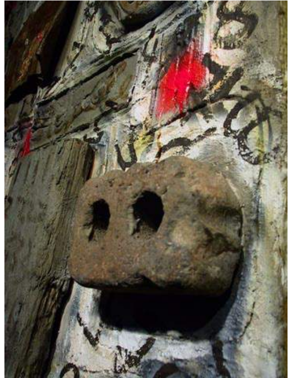
Traffic Jam, 2007

112x119cm, concrete, scrap metal, styrofoam, wood, bricks, spray paint on wooden board