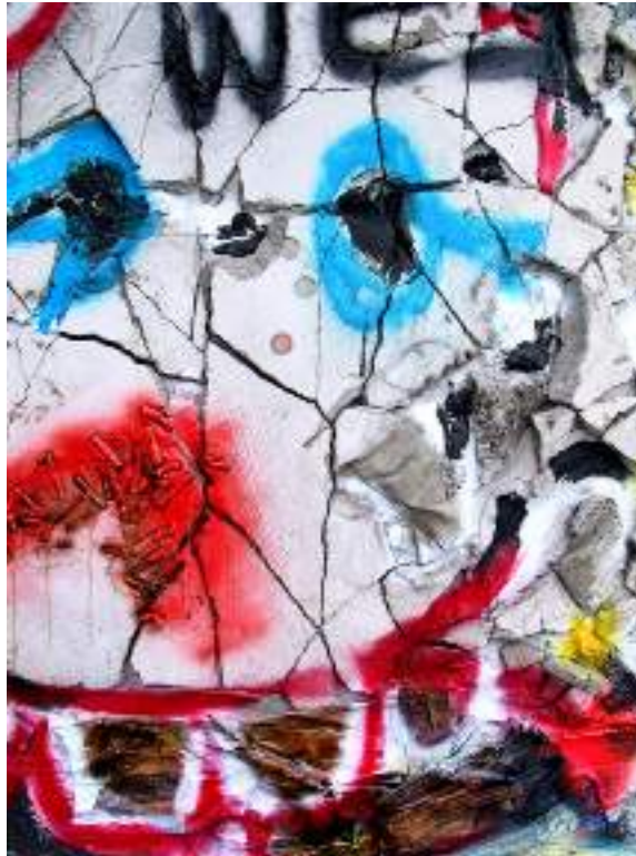
Do You Need Eyeglasses?, 2007 126x108cm, concrete, stained glass, newspaper, found objects, spray paint on wooden board