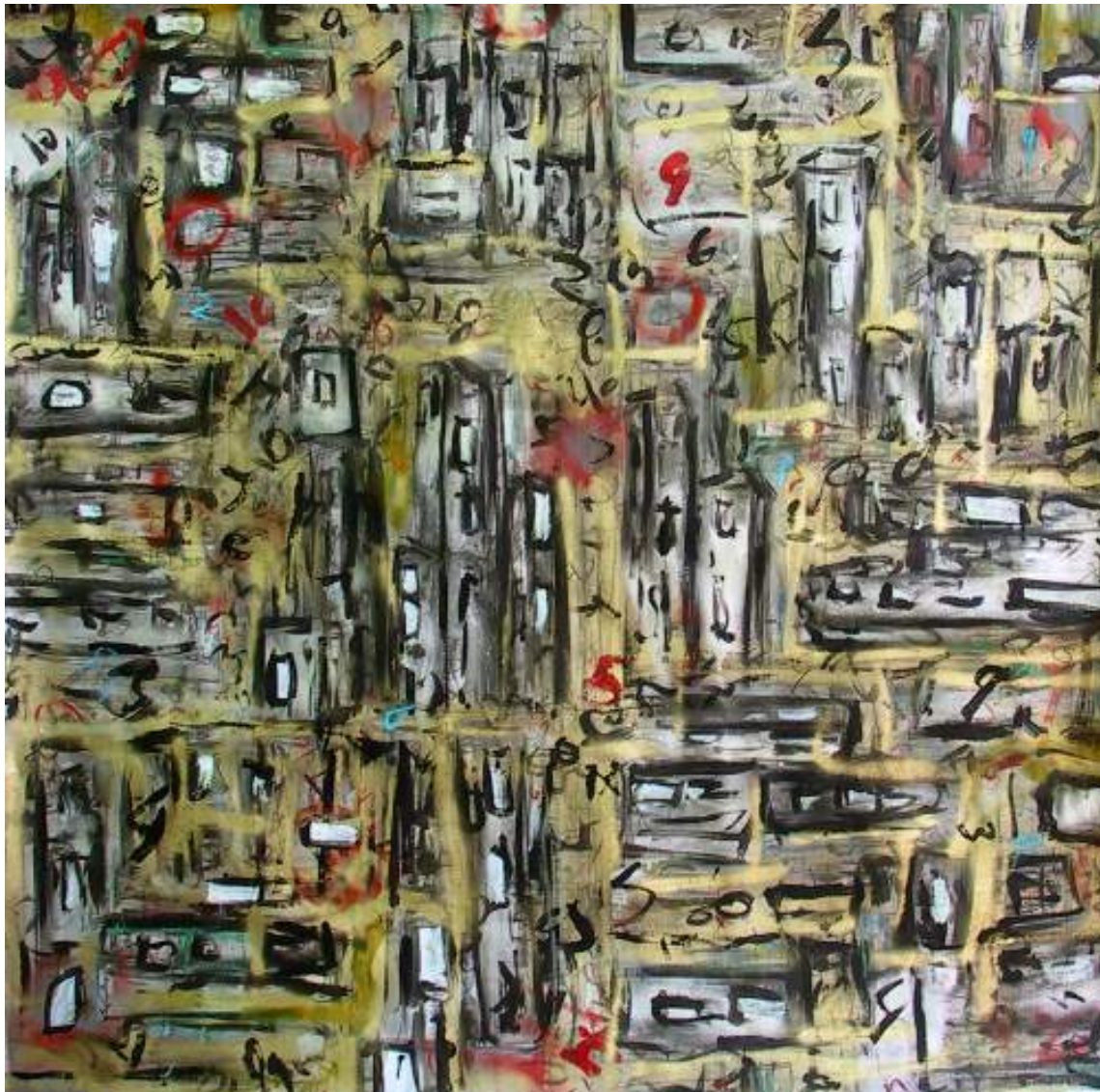
Where the Streets are Paved with Gold, 2008 120x118cm, mixed media on paper